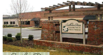
Southern Pines Corporate Park