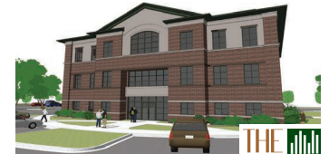
THE SUMMIT ON ONE BUSINESS CAMPUS